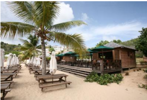
Enlarge Photo Zach Stovall