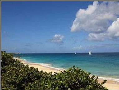
The beach at Meads Bay in Anguilla.

The Caribbean likely has as many beaches as Canada has hockey rinks -- so many great ones, in fact, it's next to impossible to narrow it down to just three.